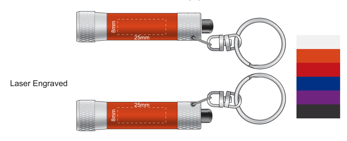
Engraves to Oxidised White